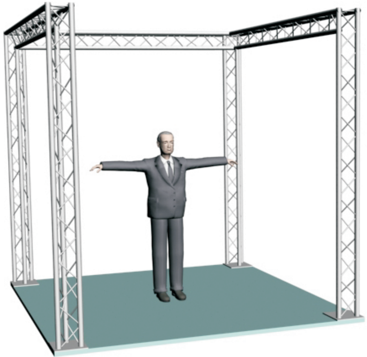
EXHIBIT AND DISPLAY TRUSS.COM

TEL: 905-509-0331 FAX: 905-509-0476 info@exhibitanddisplaytruss.com